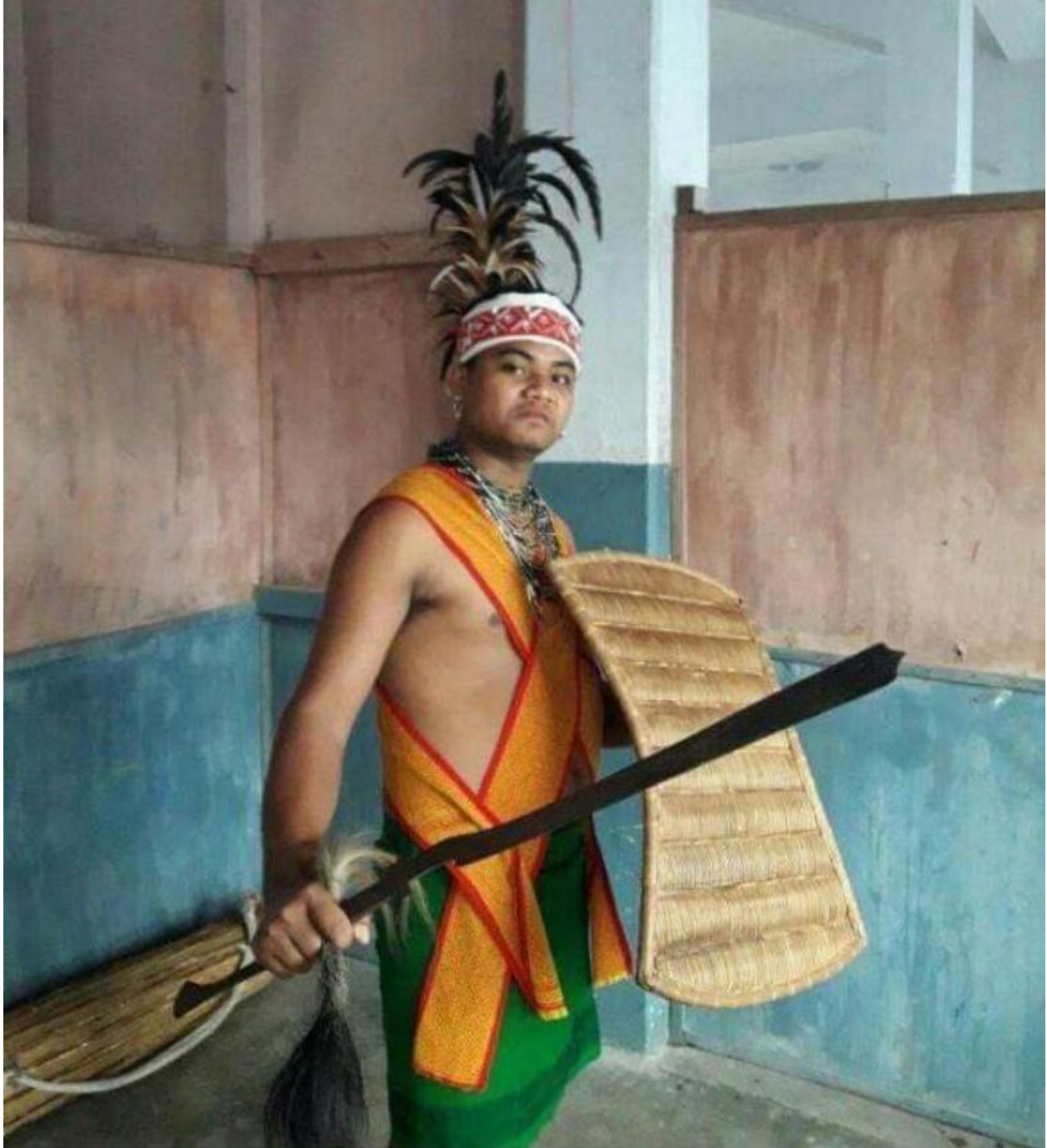
This is a picture of A.chik boy with a traditional dress.

In this picture shows about how the A.chik men resistance for enemies by holding a sword and shield. Some of the names about the dress of A.chik men are ; naderong (earings), kotip ( a turban), rikgitok (necklace), do.me ( the plume feathers of the bhimraj bird or of cock worn on the head), gana( traditional dress of A.chik) which is used to put on the lower body, pandra (dupatta) a long piece of cloth worn around the neck ad shoulder. He was holding a swords in his right hand and shield in his left hand which is used to resistance for enemies.